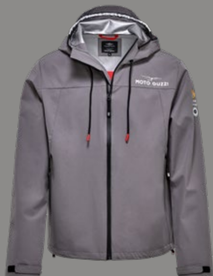
SOFT SHELL JACKET AVIAZIONE NAVALE