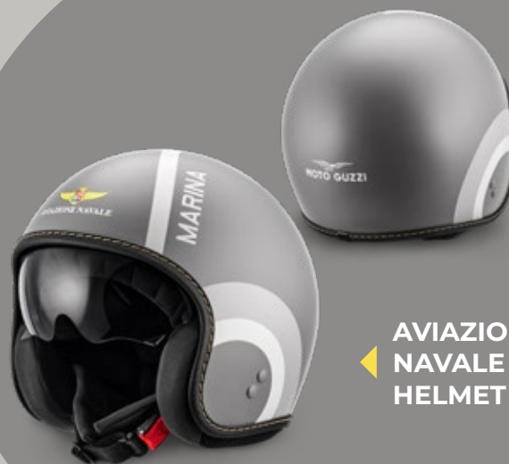
AVIAZIONE NAVALE HELMET