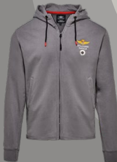
SWEATSHIRT AVIAZIONE NAVALE