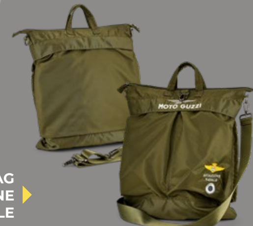
BAG AVIAZIONE NAVALE