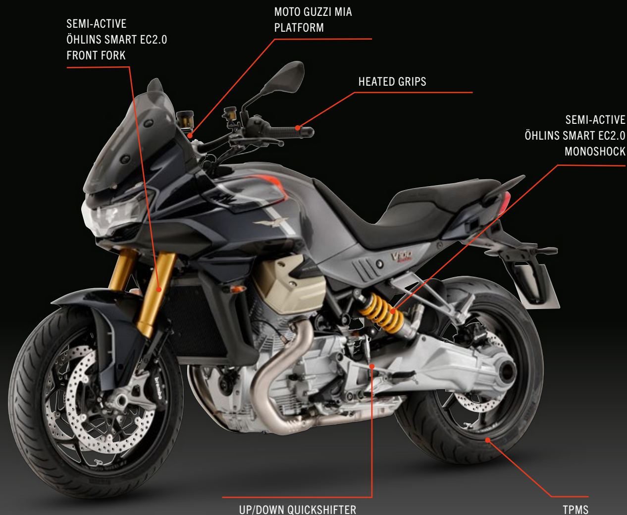
V100 MANDELLO S