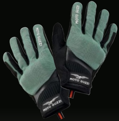
▲ SUMMER TOUCH V100 GLOVES