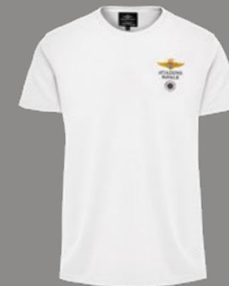
T-SHIRT AVIAZIONE NAVALE