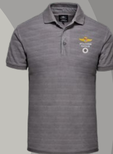
POLO AVIAZIONE NAVALE