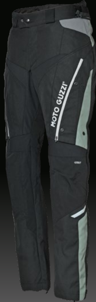
TECHNICAL V100 PANTS ▶