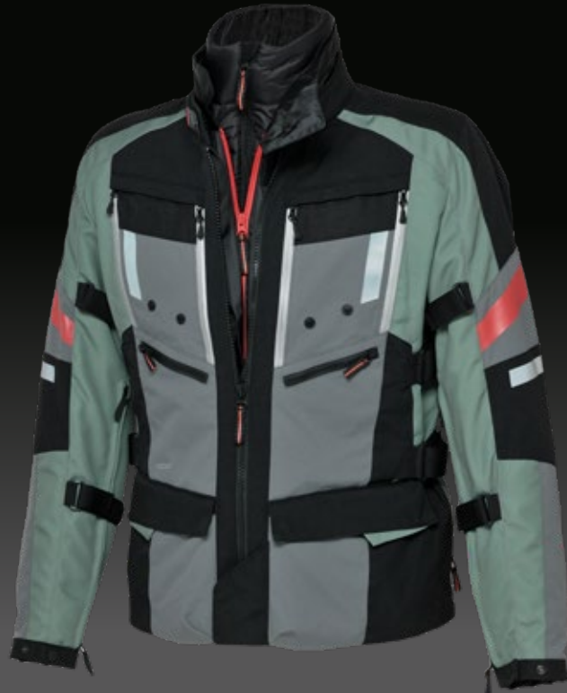
TECHNICAL V100 JACKET ▶