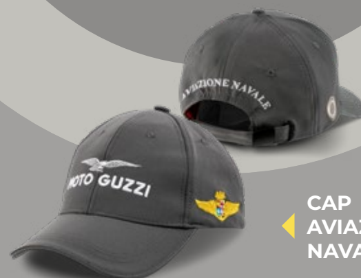
CAP AVIAZIONE NAVALE