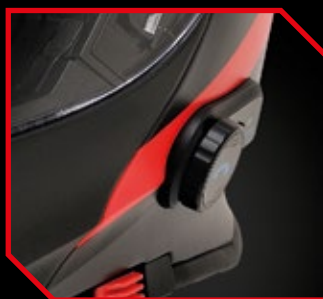
Modular Helmet with Bluetooth