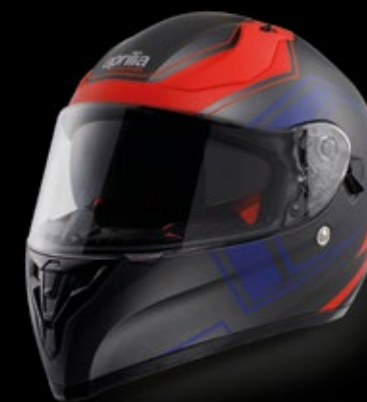
Full Face Helmets