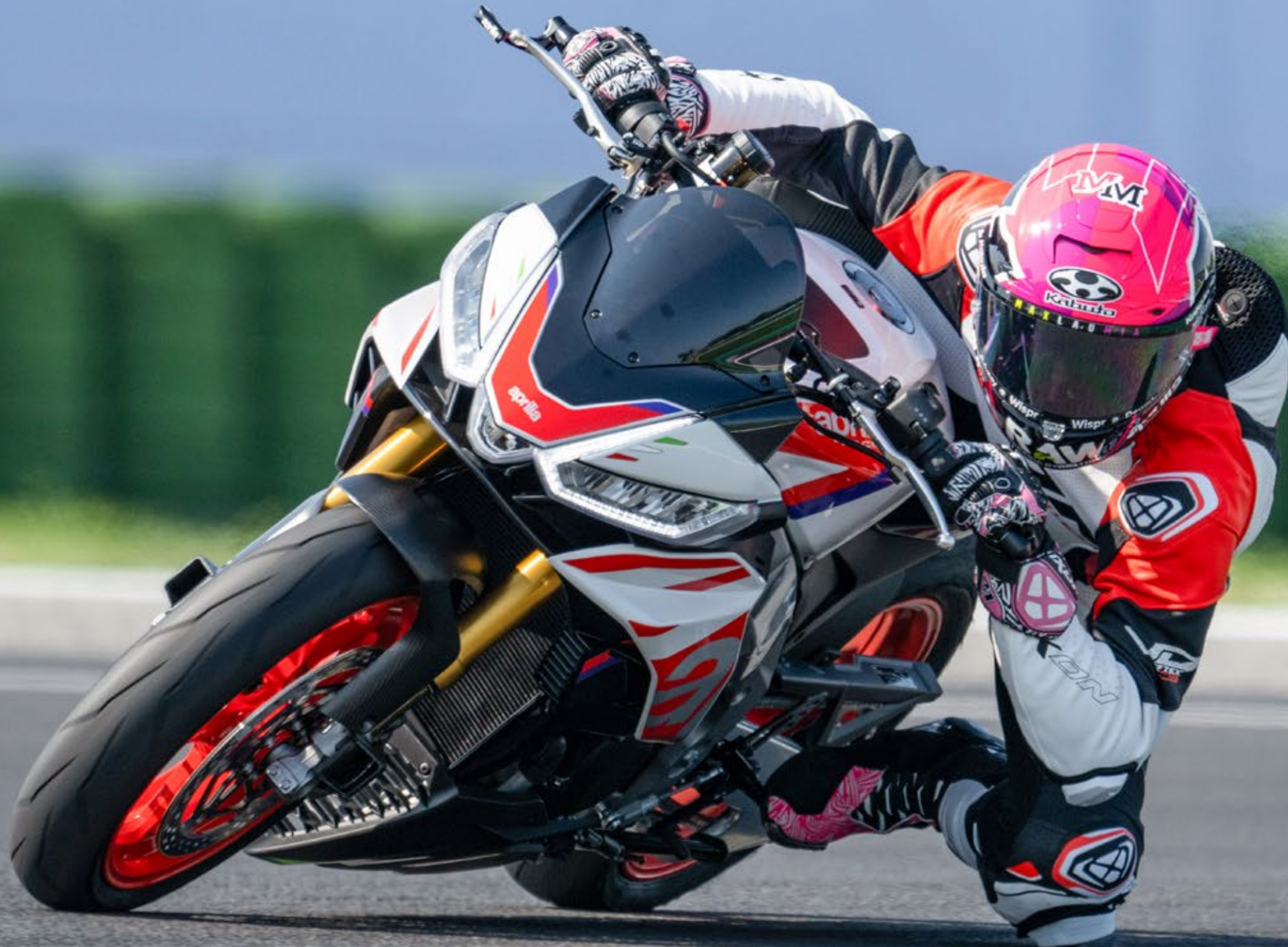
Aleix Espargaró, MotoGP rider