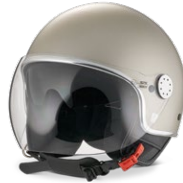
MIRROR HELMET ○ ● ● ● ● ●