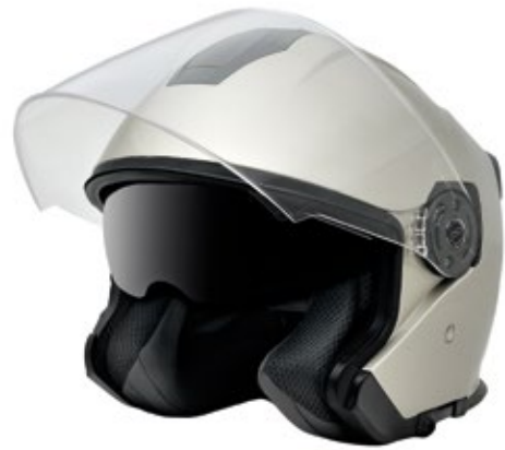
PFJ HELMET ○ ● ●