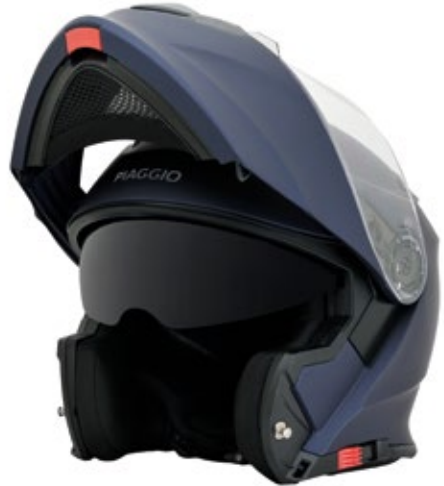
MODULAR HELMET ○ ● ●