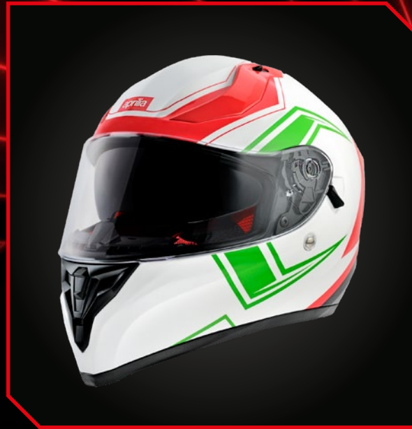
APRILIA FULL FACE HELMET