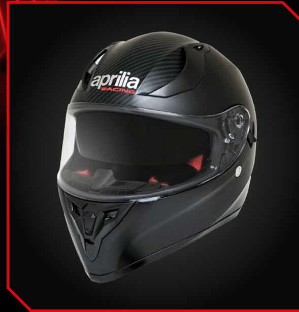
APRILIA FULL FACE HELMET