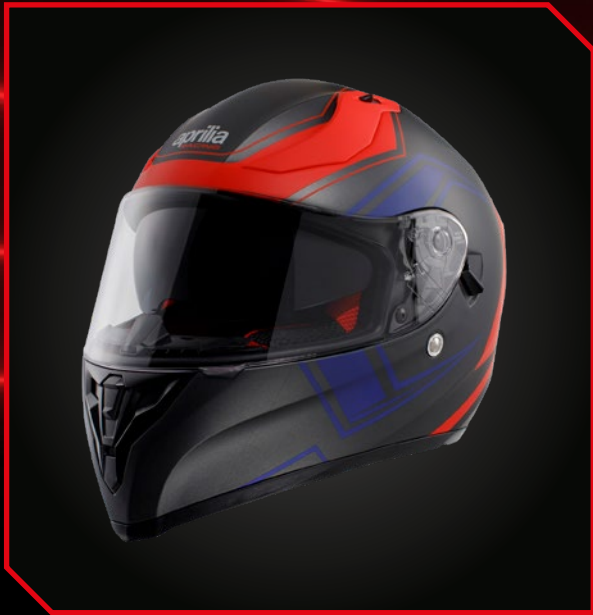
APRILIA FULL FACE HELMET