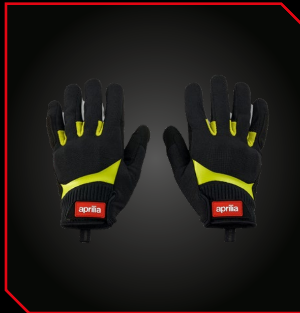
SUMMER TOUCH GLOVES